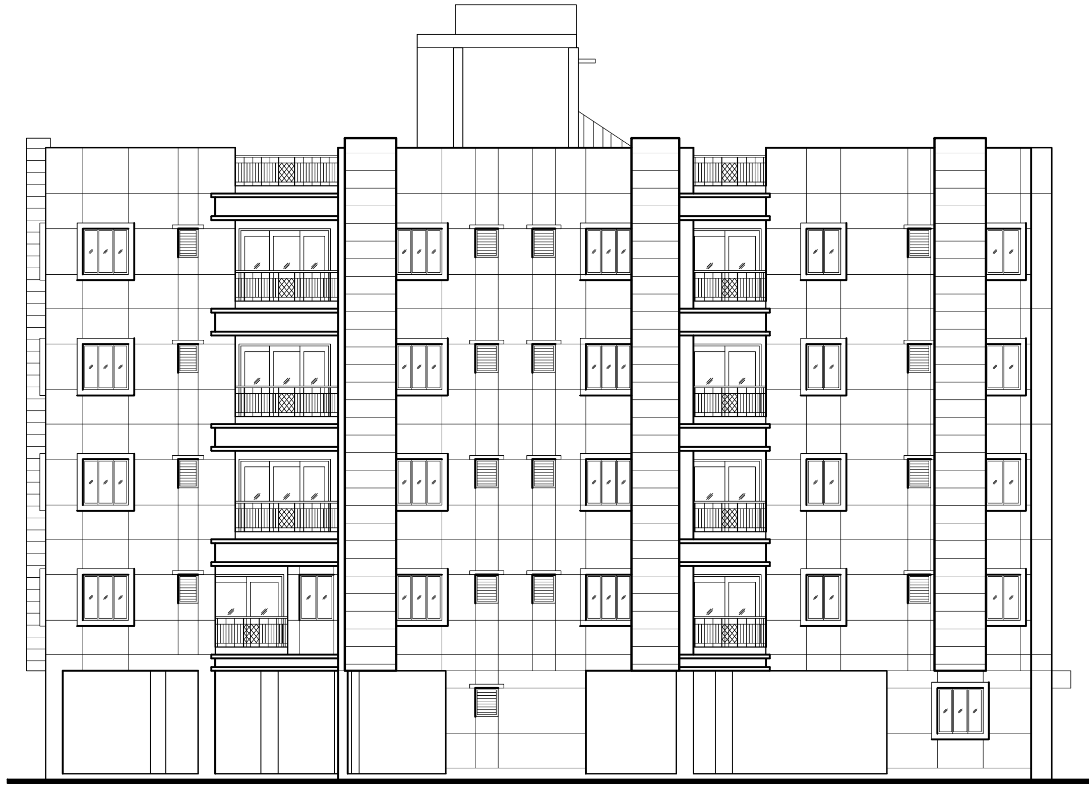
EAST SIDE ELEVATION SCALE = 1:100