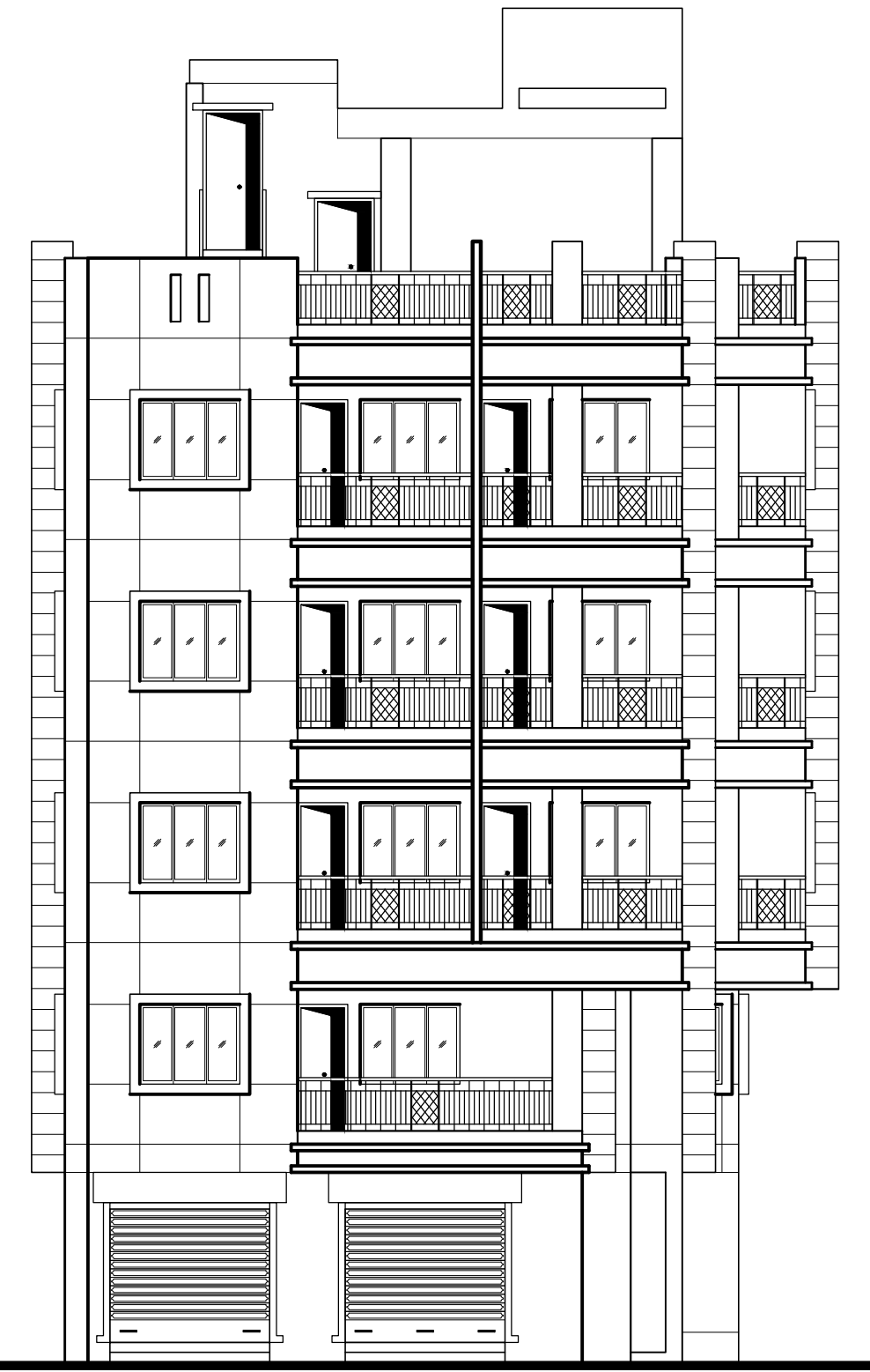
FRONT SIDE ELEVATION SCALE = 1:100